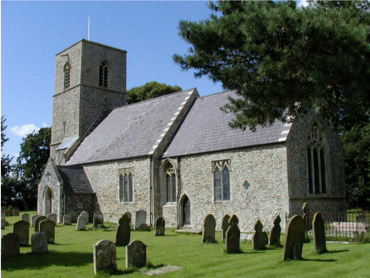
View of the church from near the gateway to the churchyard

The parish church is situated, not in the village, but on a short rise of land well outside, surrounded by fields. The tower is Norman, making it at least eight or nine hundred years old, although other parts of the building are of a later date.