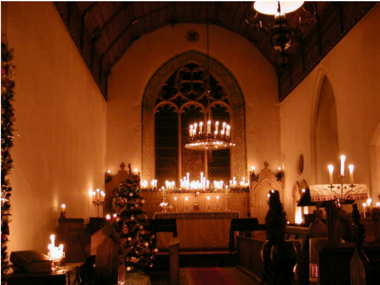
The scene inside the church, before the service began, Christmas Eve December 2000

A few years ago I decided to travel up on Christmas eve for the late night service in the little church. The first time was 1983. It is always a special occasion. Because the church is not connected to mains electricity, the interior is lit using several oil-lamps along with many hundreds of household candles. The effect is quite delightful and, with a usually packed church, it is quite an event in itself.