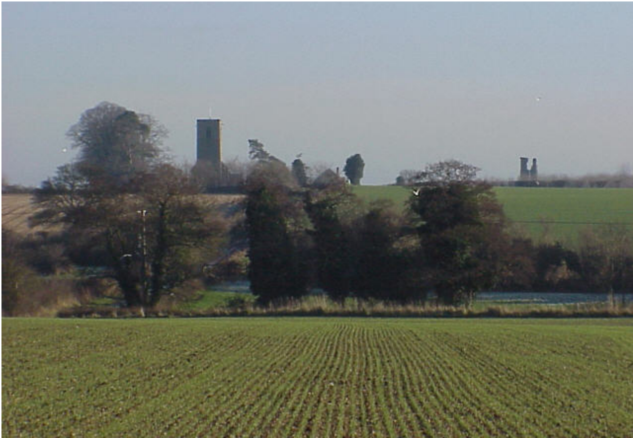
All Saints church is to the left of the view with the old tower on the right

Here is one corner of Norfolk which is still deeply rooted in the 19th and 20th centuries, while it lives in the 21st century. Long may it continue !